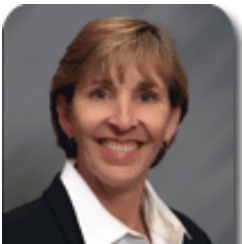
Dino Champagne Asset Preservation, Inc.